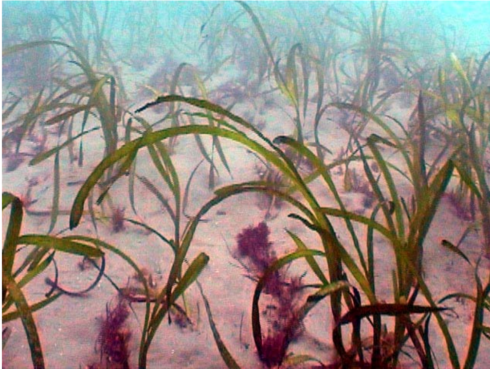
Figure 5. Eelgrass, Zostera marina . One “shoot” and the cluster of “blades” arising from the shoot is considered a “turion unit”.

diversity approximately two to three ft long attracts many marine invertebrates and fishes and the of the marine life compared to areas where the sediments are barren. A diverse community of bottom-dwelling invertebrates (i.e., clams, crabs, and worms) live on eelgrass or within the soft sediments that cover the root and rhizome mass system. The vegetation also serves a nursery function for many juvenile fishes, including species of commercial and/or sports fish value (California halibut and barred sand bass). Eelgrass meadows are critical foraging centers for seabirds (such as the endangered California least tern) that seek out baitfish (i.e., juvenile topsmelt) attracted to the eelgrass cover. Lastly, eelgrass is an important contributor to the detrital (decaying organic) food web of bays as the decaying plant material is consumed by many benthic invertebrates (such as polychaete worms) and reduced to primary nutrients by bacteria.