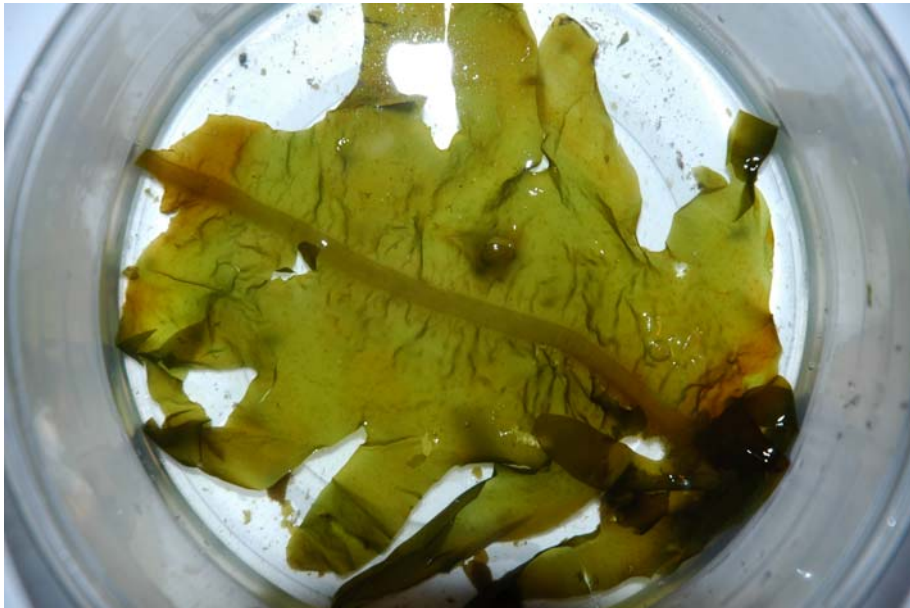
Figure 7. Undaria pinnatifida

Undaria pinnatifida (Figure 7) is a golden brown kelp native to the Japan Sea. It has been introduced in Australia, New Zealand, and Europe and has now spread to the California coastline. It has been found in Santa Barbara Harbor, Long Beach Harbor, Anaheim Bay, San Diego Bay, and on Catalina Island. Undaria was not observed during dive surveys in Dana Point Harbor in February or March, 2007.