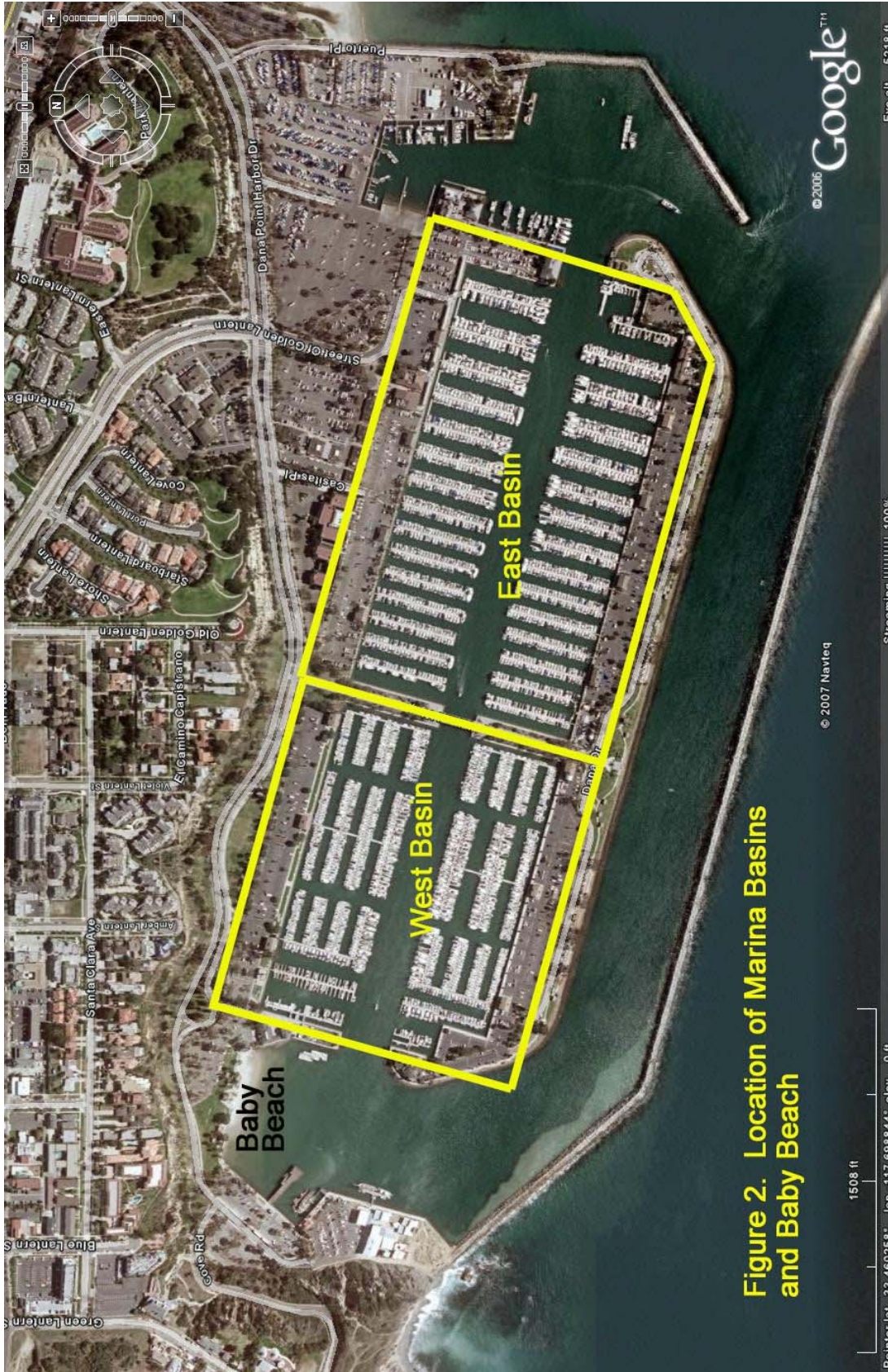
Figure 2. Location of Marina Basins and Baby Beach